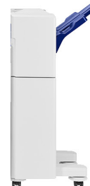
B4 FINISHER 2