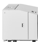
B2 HIGH-CAPACITY FEEDER 2,940 SHEETS