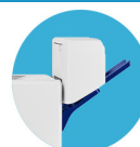
OPTIONAL BOOKLET MAKER FOR B4 FINISHER