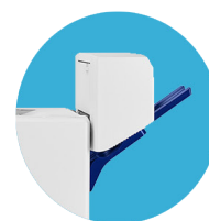
OPTIONAL BOOKLET MAKER FOR B4 FINISHER