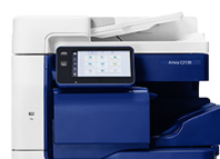
A2 INTERNAL FINISHER