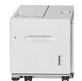
B1 HIGH-CAPACITY FEEDER 2,000 SHEETS